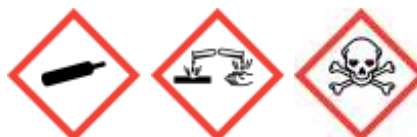
GHS04 GHS05 GHS06